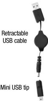
Retractable USB cable